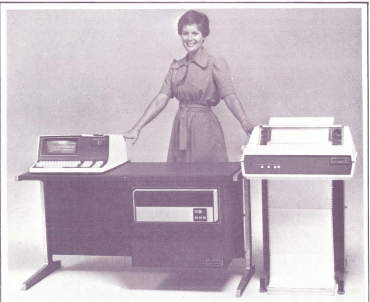
The Datapoint 4520 includes a 48K processor, 2.5/2.5 MB disk storage, multiport adapter, and system software. Optional belt printer shown.

These coordinators will also determine lease to purchase conversion pricing for peripheral equipment pricing.